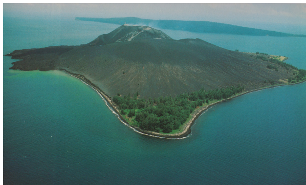
Figure 2. Anak Krakatau, from the east in 1985, looking on to developing Casuarina forest on the Eastern Foreland (Sertung in background).

No systematic zoological surveys were made on Anak Krakatau for almost 30 years from 1952, so that critical early stages of colonization and succession have not been recorded. Since the mid-1990s, more recent work by visiting biologists has become infrequent because of political difficulties and continuing volcanic activity. The ecological validity of surveys is also being distorted because the island is subjected to largely uncontrolled visitation by tourists and others, despite formal need for permits for landing access. The major data on successions and invertebrates have thus come largely