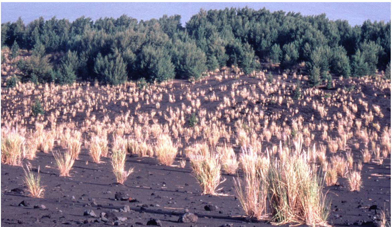
Figure 4. The spread of Saccharum spontaneum tussocks up the bare volcanic slope above the Eastern Foreland, 1993.

was described by Suzuki et al. (1995). Saccharum grass clumps extended progressively up the outer ash cone as the major pioneer species away from the coast (Fig. 4). At the time of our work in the 1980s, the vegetated area of Anak Krakatau was only about 17 ha of the total island area of about 235 ha, and the coastal length available for arrivals by sea was 7-8 km. Rafting has clearly been important for such arrivals, with seeds of numerous plants (propagules of 66 taxa in 1990-91, with only 30 of these known from elsewhere in the archipelago: Partomihardjo et al. 1993) found in strand surveys, and logs and large complex mats of vegetation a clearly viable vehicle