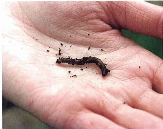
Figure 3. Lumbricus castaneus found in Skaftafell in Southern Iceland.

Collembolans and earthworms are part of the decomposition food web and their consumption of dead plant material leads to fragmentation,