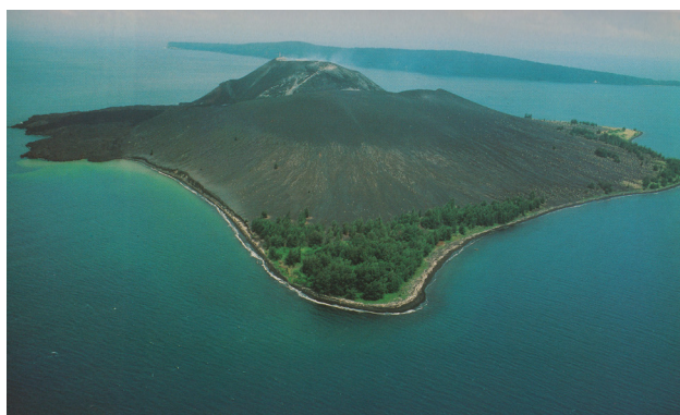
Figure 2. Anak Krakatau, from the east in 1985, looking on to developing Casuarina forest on the Eastern Foreland (Sertung in background).

No systematic zoological surveys were made on Anak Krakatau for almost 30 years from 1952, so that critical early stages of colonization and succession have not been recorded. Since the mid-1990s, more recent work by visiting biologists has become infrequent because of political difficulties and continuing volcanic activity. The ecological validity of surveys is also being distorted because the island is subjected to largely uncontrolled visitation by tourists and others, despite formal need for permits for landing access. The major data on successions and invertebrates have thus come largely