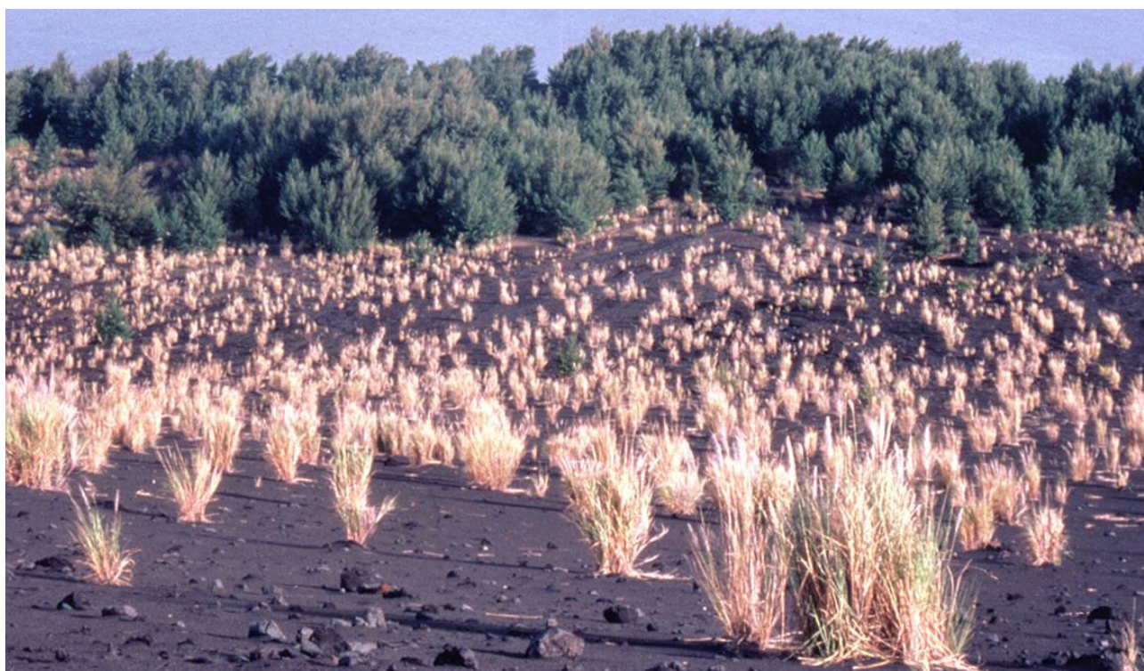
Figure 4. The spread of Saccharum spontaneum tussocks up the bare volcanic slope above the Eastern Foreland, 1993.

was described by Suzuki et al. (1995). Saccharum grass clumps extended progressively up the outer ash cone as the major pioneer species away from the coast (Fig. 4). At the time of our work in the 1980s, the vegetated area of Anak Krakatau was only about 17 ha of the total island area of about 235 ha, and the coastal length available for arrivals by sea was 7-8 km. Rafting has clearly been important for such arrivals, with seeds of numerous plants (propagules of 66 taxa in 1990-91, with only 30 of these known from elsewhere in the archipelago: Partomihardjo et al. 1993) found in strand surveys, and logs and large complex mats of vegetation a clearly viable vehicle