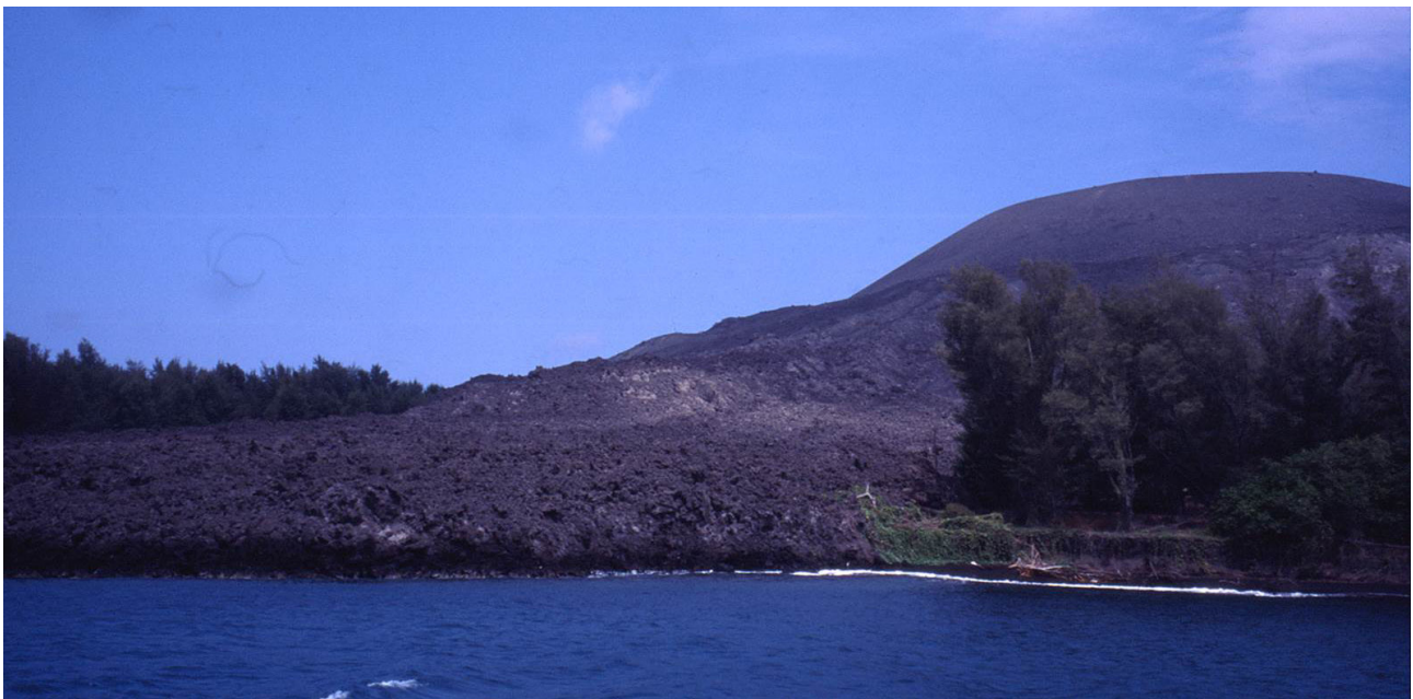
Figure 5. Interruption of vegetation between Northeastern Headland and Northern Foreland by volcanic lava flow of 1993.

Volcanic activity may be both a great benefit and a severe threat to the biota present. In the short term, low level activity is a deterrent to some visitation and may thus be a considerable protection against human disturbance with little impact on other biota. In the longer term, increased volcanic activity may destroy all that is present. It is believed by some that Anak Krakatau's recent sustained activity may be a prelude to a far more devastating eruption – perhaps within the next few decades, and possibly equivalent to the 1883 episode in intensity and impact. Information on the island's ecology will then become of historical interest but may also constitute a comparative template for some future equivalent study, much as information in Dammerman (1948) on the colonization of the older Krakatau islands post-1883 stimulated considerable debate.